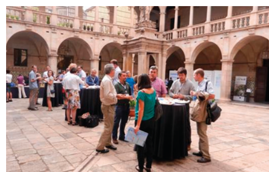
Figure 1. Participants at the 1st European Symposium on Remediation Technologies and their Integration in Water Management in Barcelona enjoying discussions with fellow participants in the courtyard of the Institute for Catalan Studies

To improve the interaction between different disciplines as well as between people involved in different aspects of water management, AQUAREHAB helped to organise the "1st European Symposium on Remediation Technologies and their Integration in Water Management" at the Institute for Catalan Studies in Barcelona on September 25-26th, 2012. The aim of this event was to bring together scientists, policy makers, consultants, site owners, water managers and remediation companies who are working on or involved in water quality issues. In this Symposium, the barriers and potential approaches to integrate groundwater and surface water issues