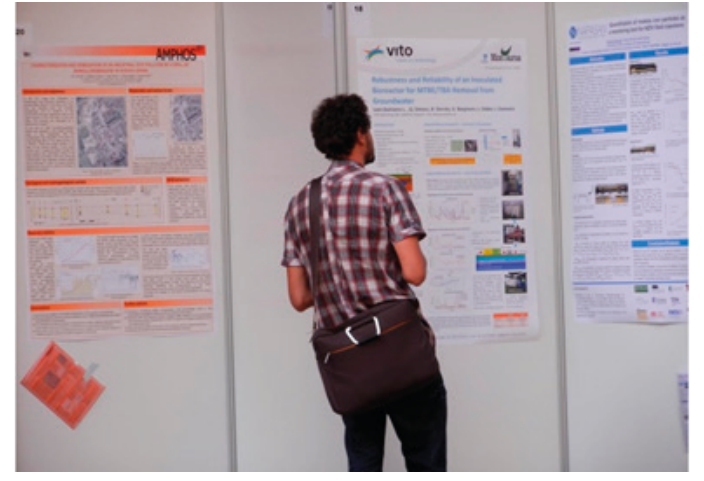
Figure 3. The poster session at the 1st European Symposium on Remediation Technologies and their Integration in Water Management