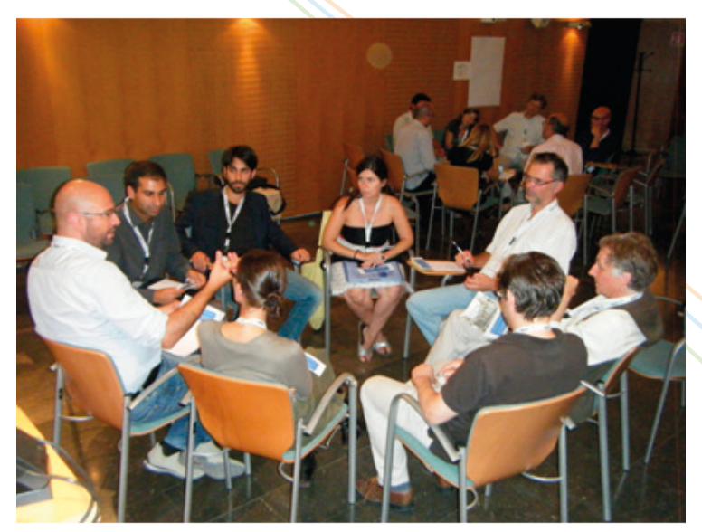
Figure 4. One of the break-out discussion groups at the Special Sessions to discuss the policy issues relevant to AQUAREHAB

The remediation technologies discussion group focussed on how policy makers deal with the time effects of groundwater remediation measures, because the effects of remediation may not be readily visible or may take years or even decades to become effective for improving the quality of surface waters. Obviously the lengthy time scale of some technological solutions has to be taken on board when designing and implementing a groundwater remediation and monitoring framework for a region. It is therefore important that the "generic guidelines on remediation technologies" provides sufficient information for policy makers and practitioners to make informed decisions on which technologies are suitable for a given situation. The required length and content of guidelines was discussed: it was concluded that different end-users may require different types and quantities of information and that as such different guidelines versions may be preferred (i.e. short and general versus long and detailed). AQUAREHAB has therefore taken great lengths that each technology developed during the project provides standardised information to support the practitioner to decide on the design and implementation of a certain technology and to assess its performance in a their field/river basin/groundwater body context.